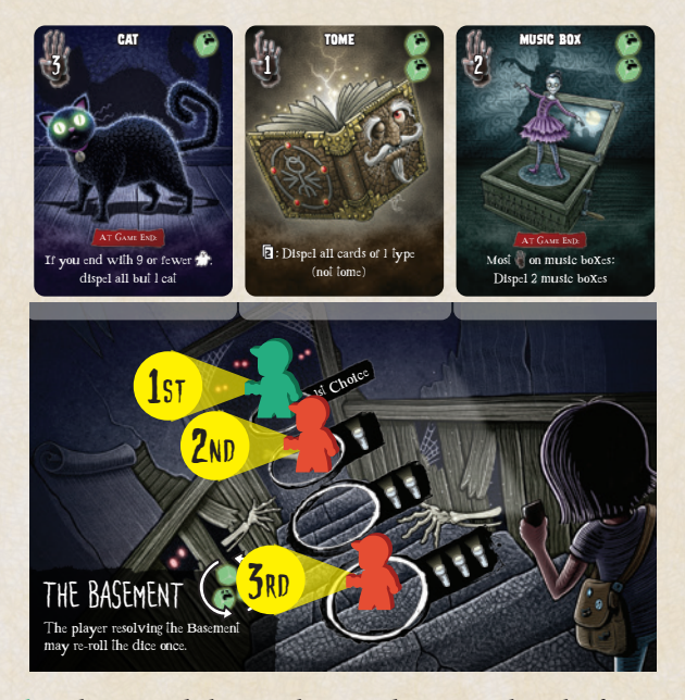
Jonah picks 1st and chooses the tome because it has the fewest Curses. Charlotte picks 2nd and 3rd and takes both remaining Cursed Cards.

2. Take Cursed Cards. Beginning with the player with the Meeple at the top and continuing down, take a Cursed Card of your choice from the Room. Keep your Cursed Cards face-up in front of your screen, separated by type. When taking a card, check its text. If you meet the condition, immediately trigger its effect (unless it says "At Game End"). Then return your Meeple to your supply.