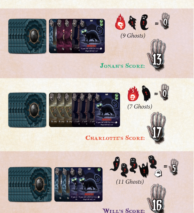
Jonah has the fewest Curses and wins the game!

The game ends when all Cursed Cards have been taken. Trigger Cursed Card effects that say "At Game End." Then reveal all players' Ghost Tokens and determine who has the most. Add up the Curse values on your face-up cards, and if you have the most Ghosts (or are tied for most), add 1 Curse per 2 Ghosts. The player with the fewest Curses wins. If tied, the player with fewer Ghost Tokens wins. If still tied, the tied players share victory.